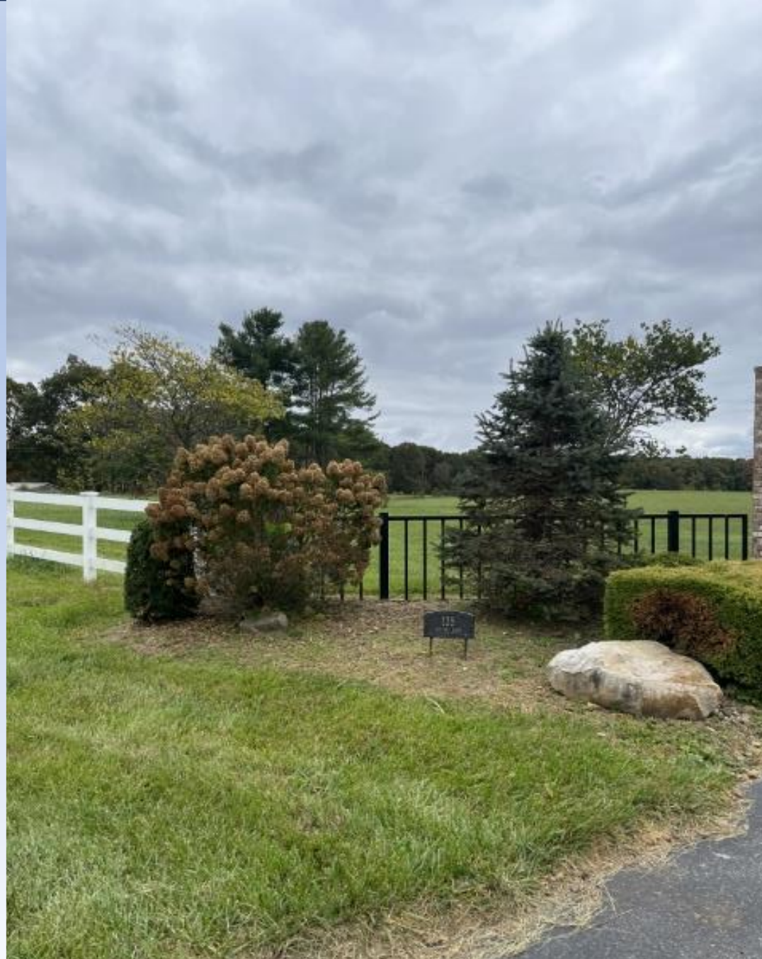
View from entrance gate