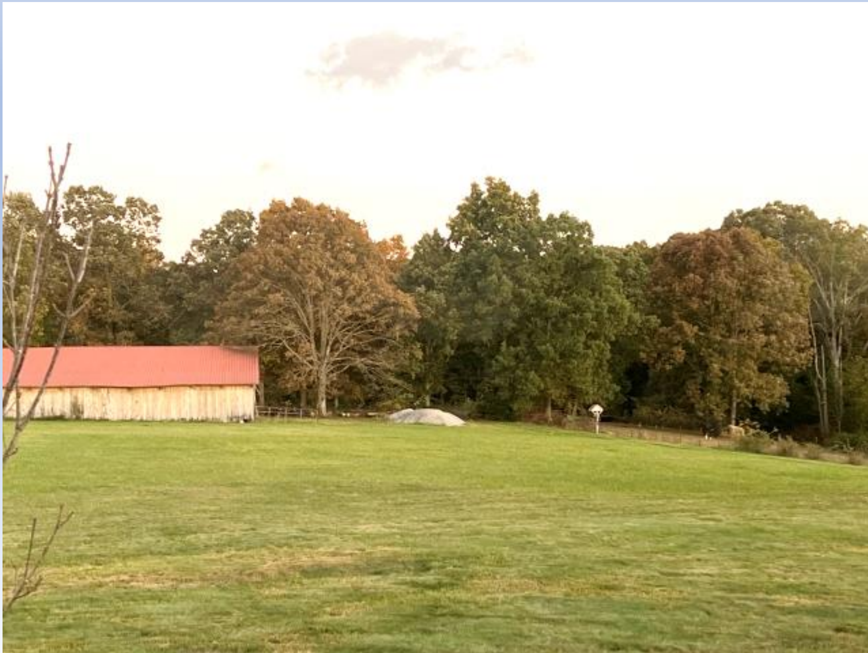
Livestock and equipment barn