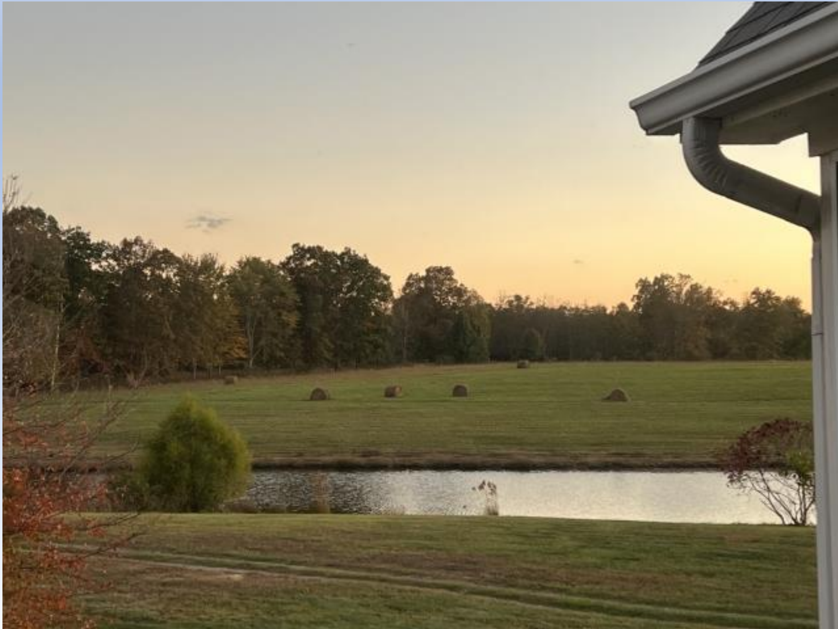
View Living Room looking Southeast