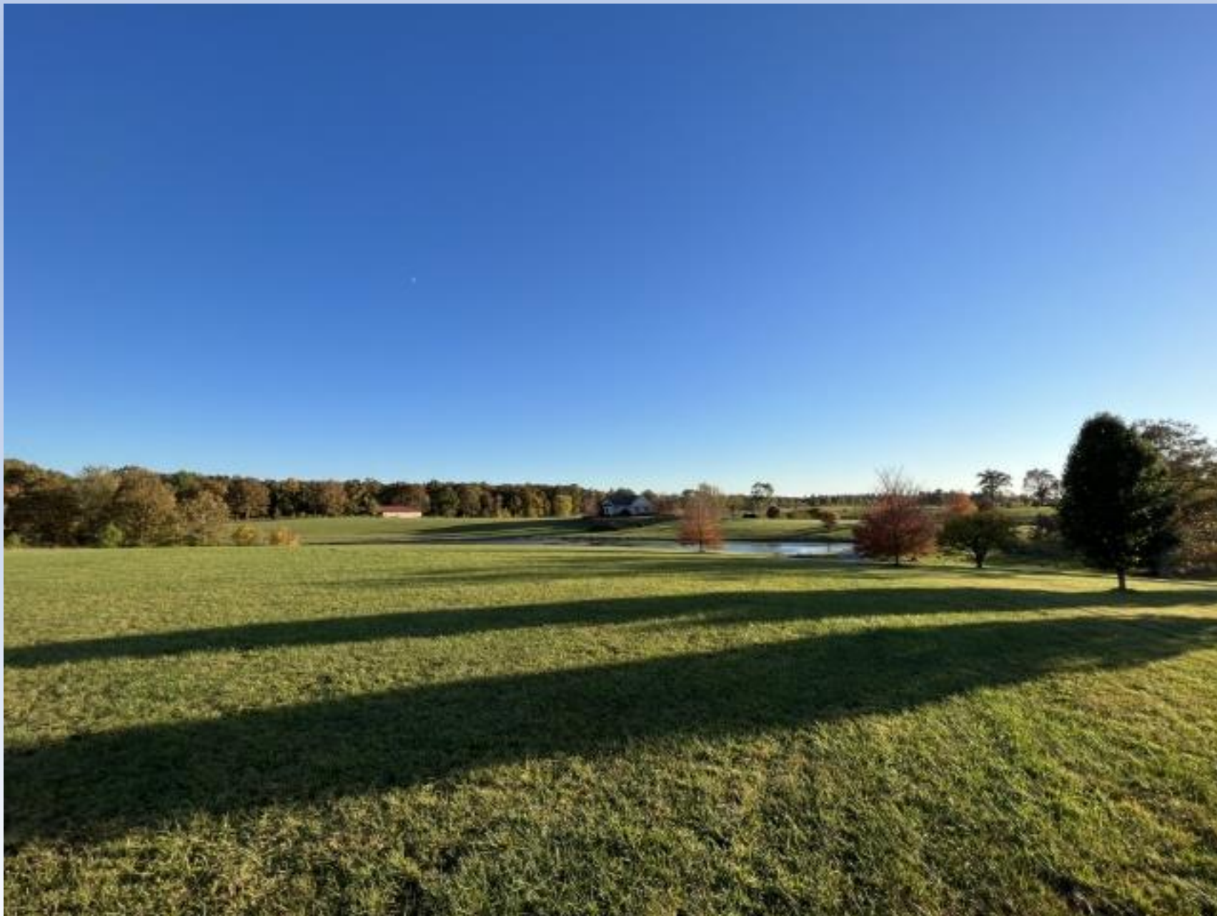
Barn and Main House from Hwy 62