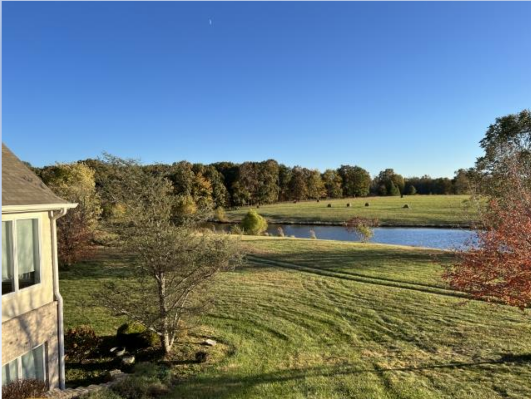
From Main House garage entry