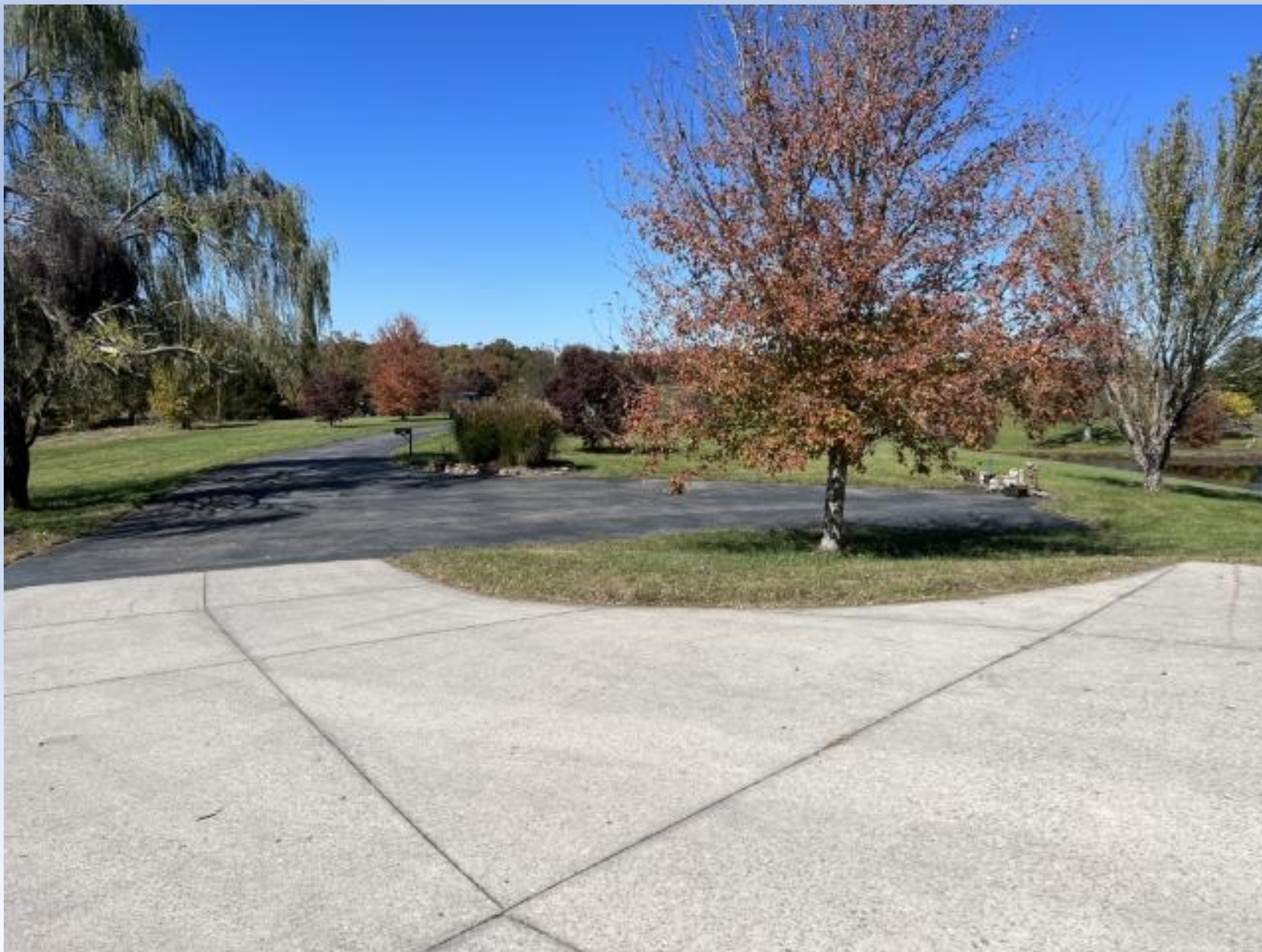
From Main House looking at access driveway