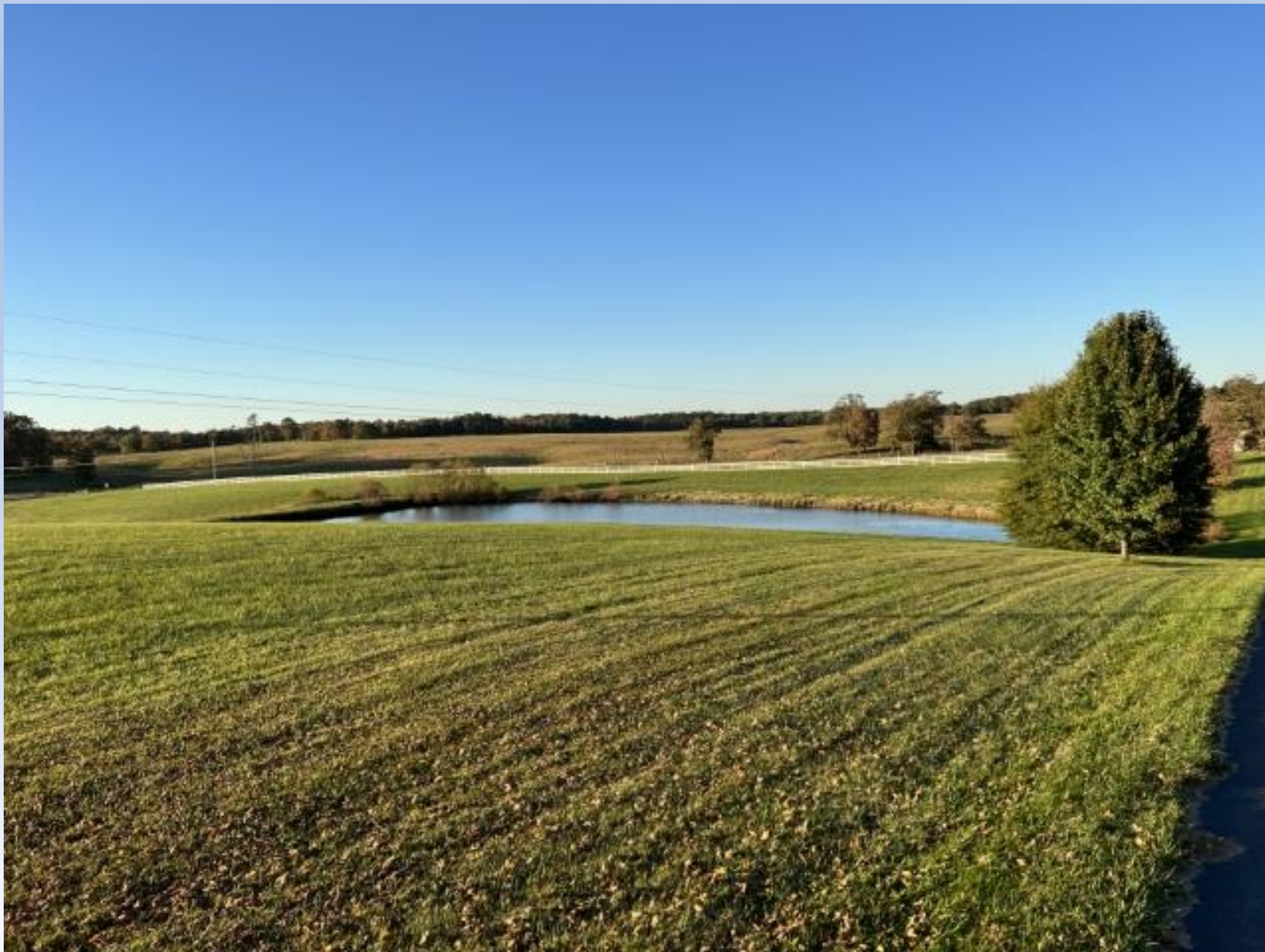
View from driveway looking back to Tn Route 62