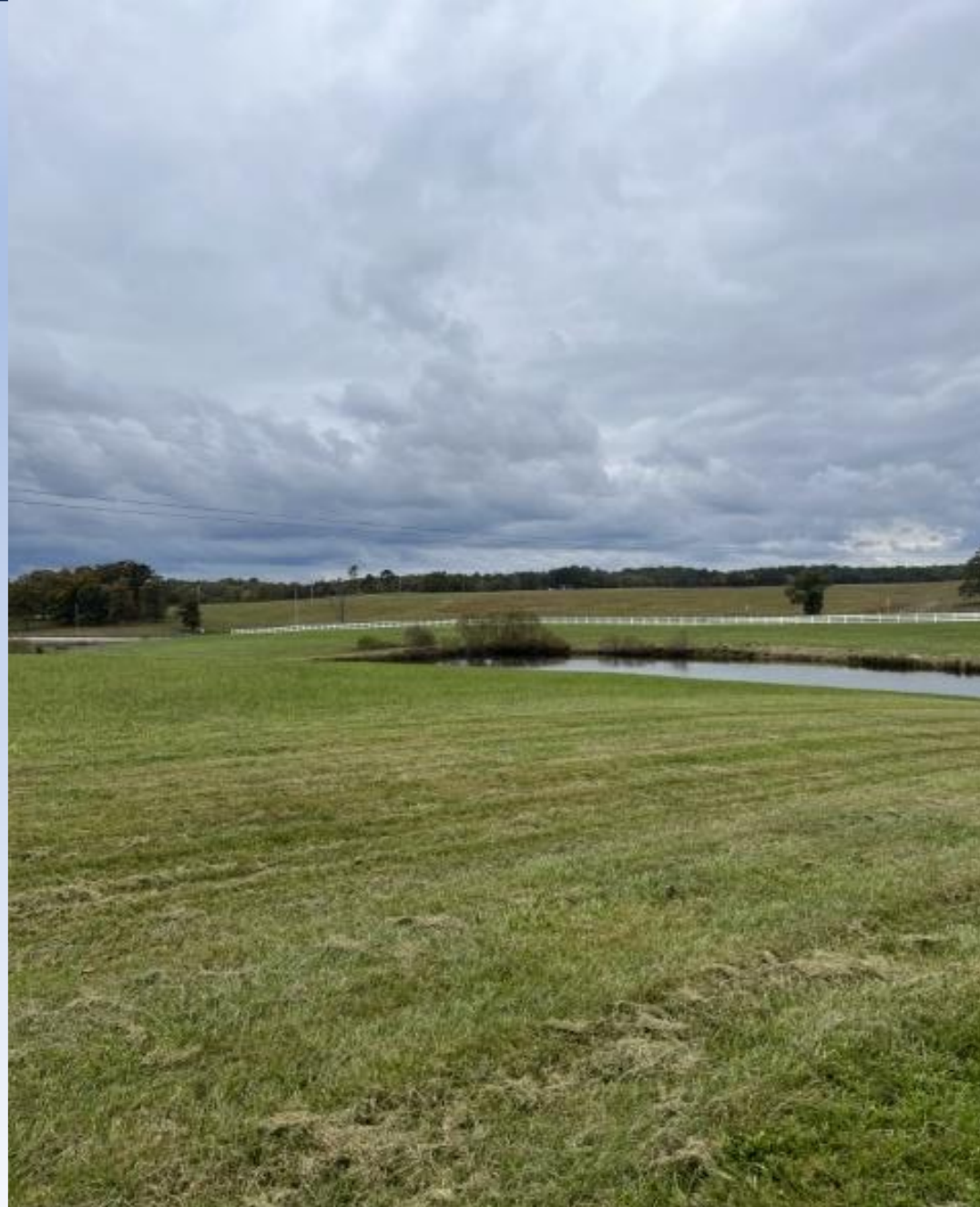
View from drive looking back to Hwy 62