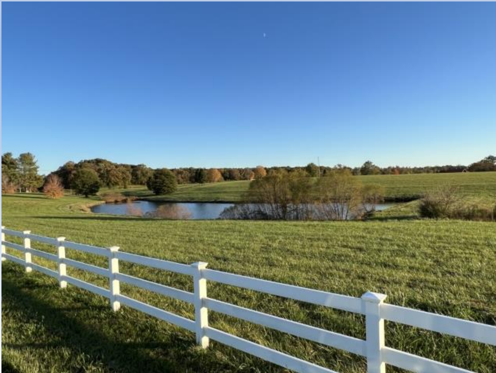
Barn and Main House from Hwy 62