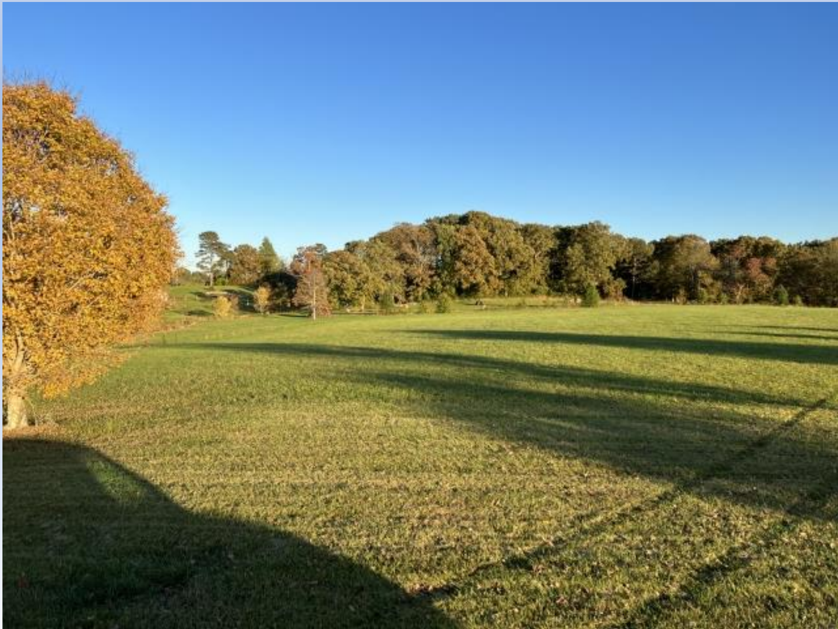
Facing Main House, looking left, Pasture