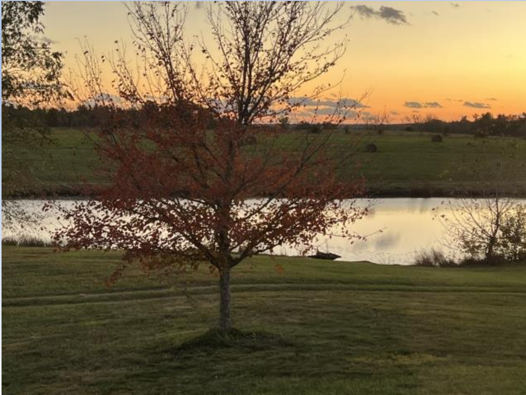
View from Breakfast nook