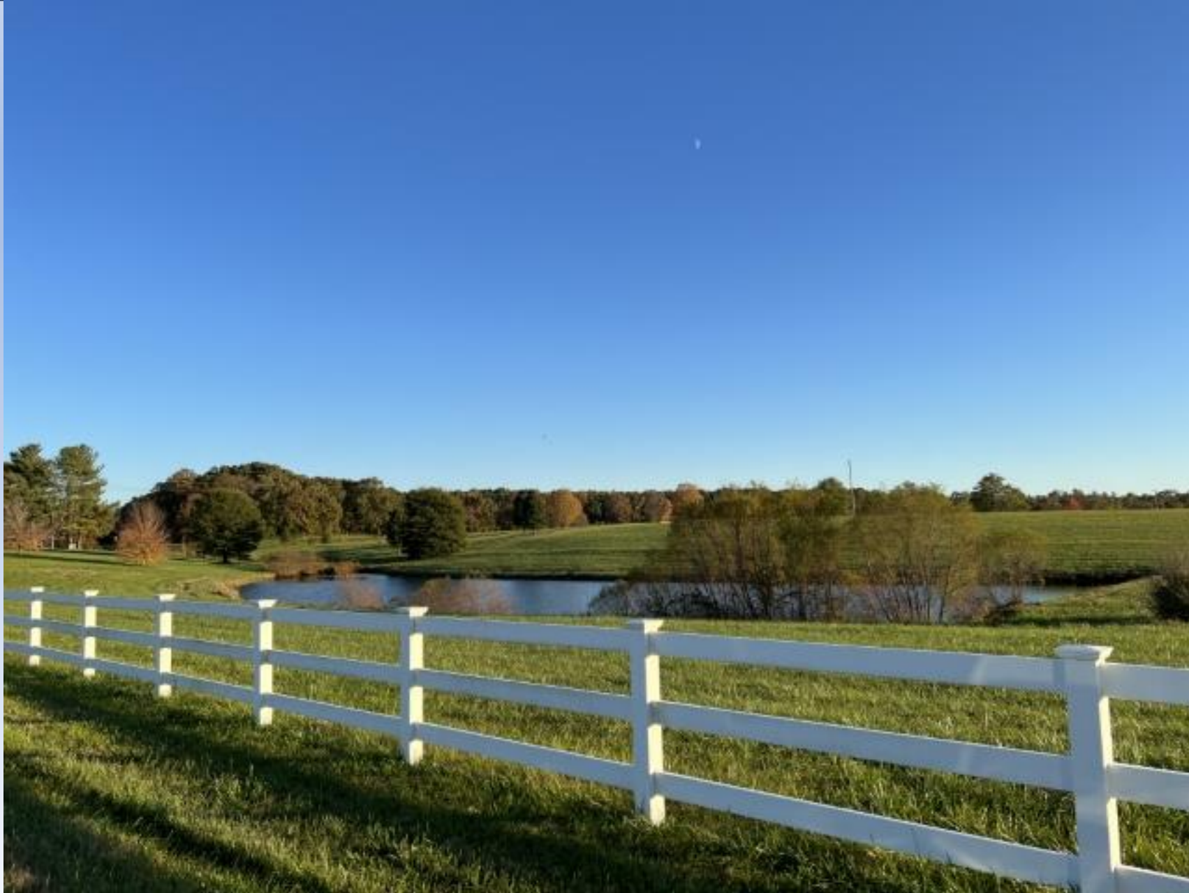
Approach view from Tennessee Route 62