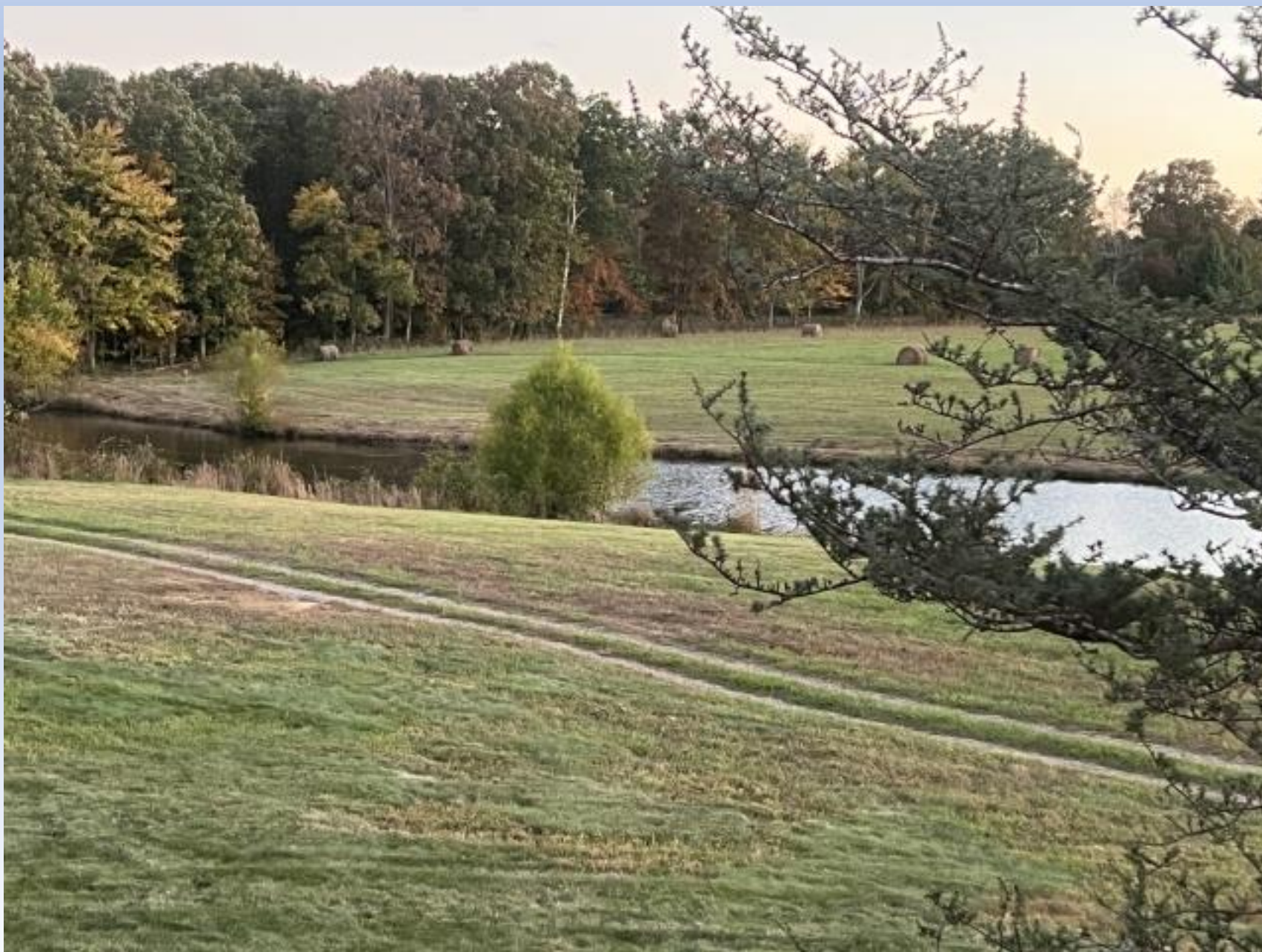
View from screen porch