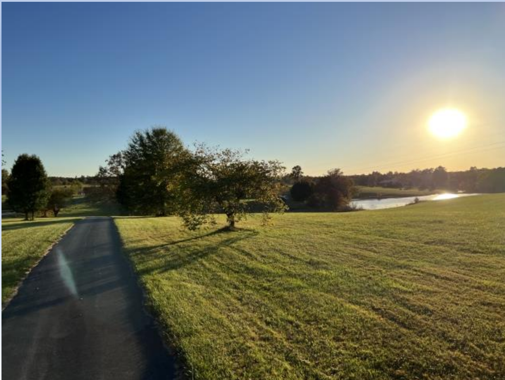
Access driveway from Hwy 62 to house and guest house