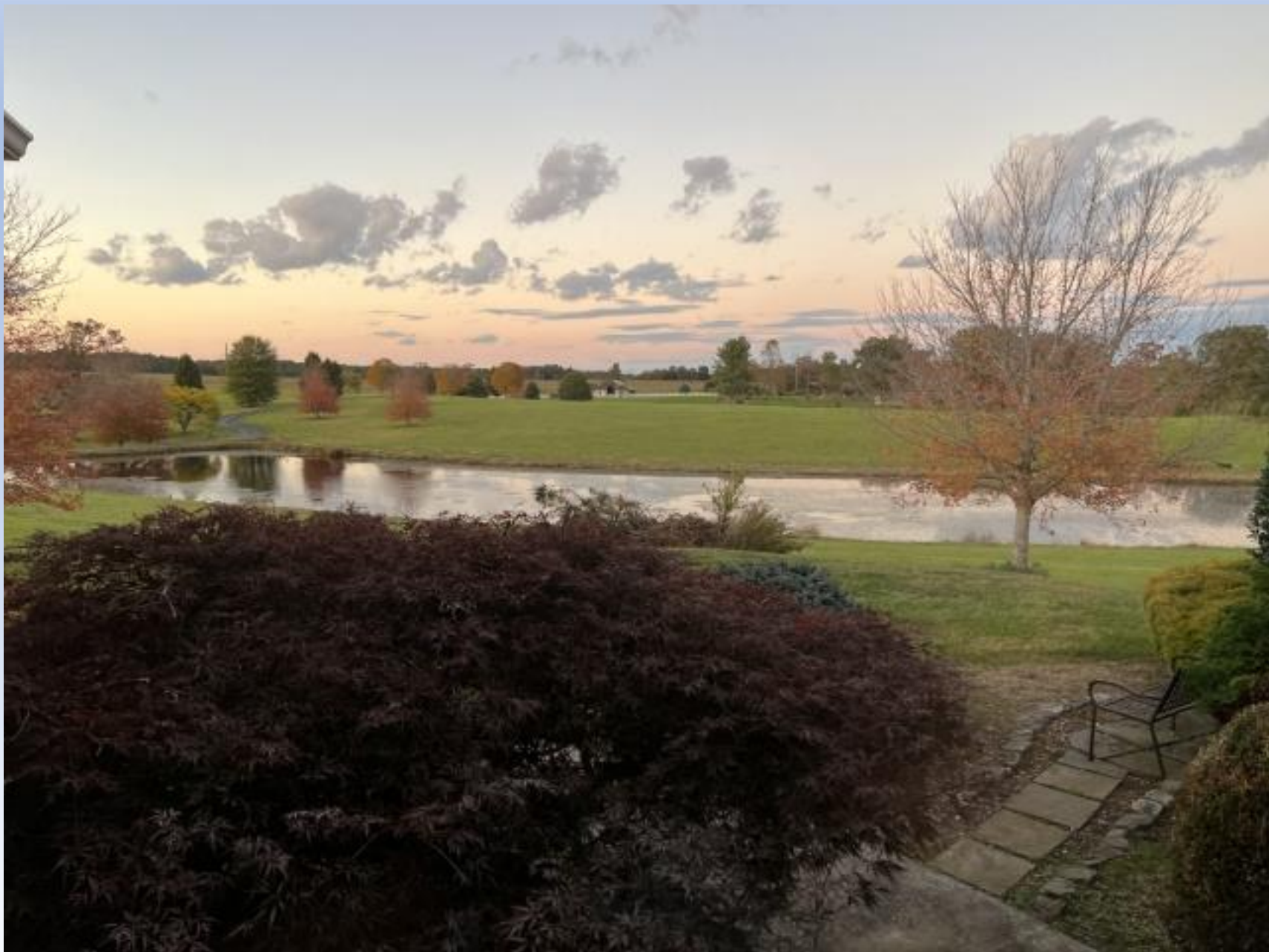
View from Entry Foyer