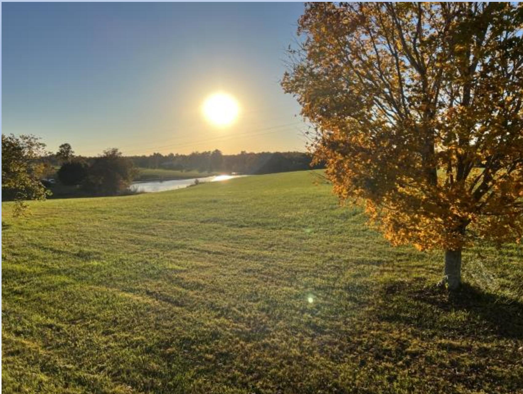
From access drive across pond. Guest cabin is to the left side.