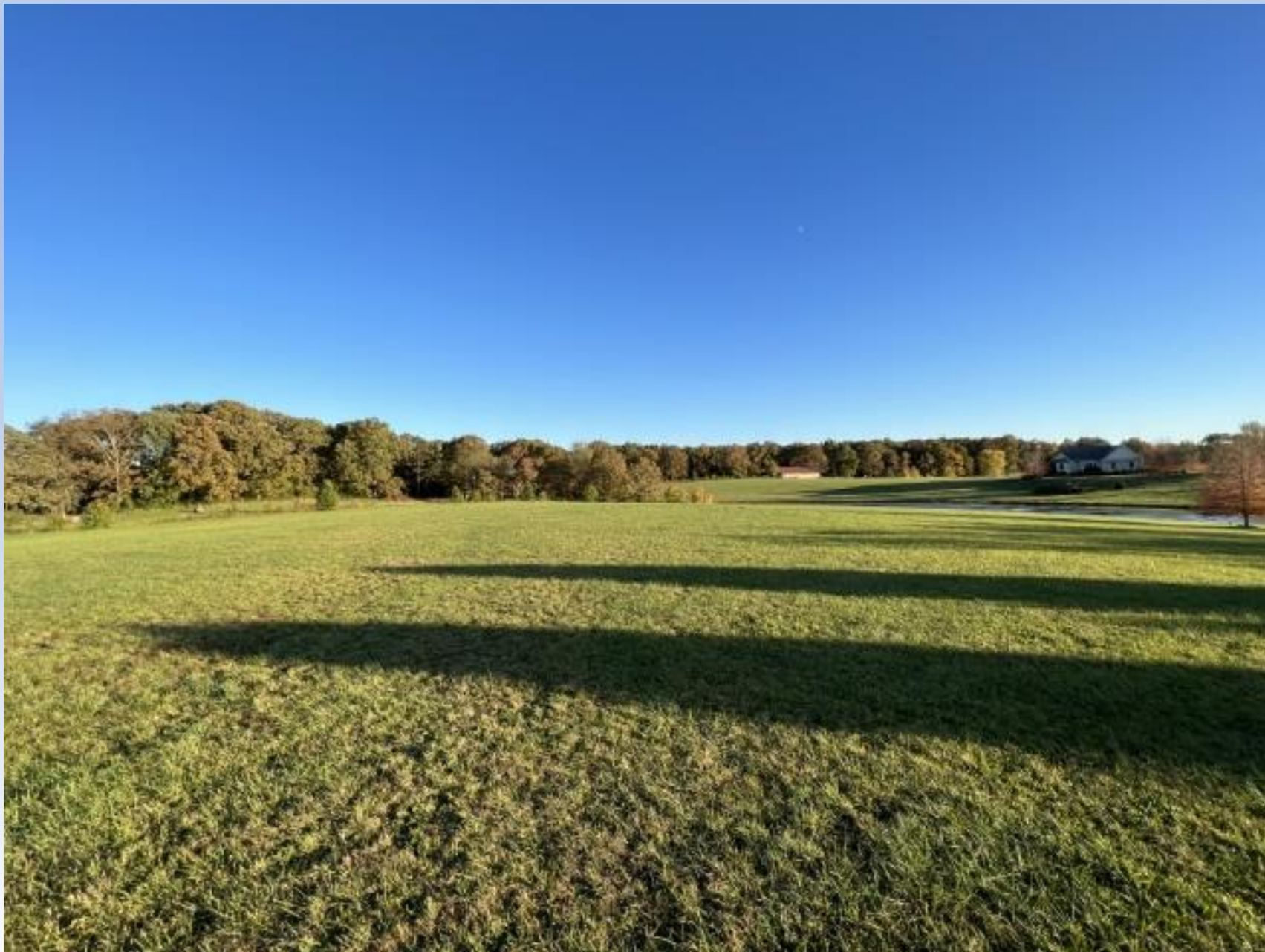
Barn and Main House from Hwy 62