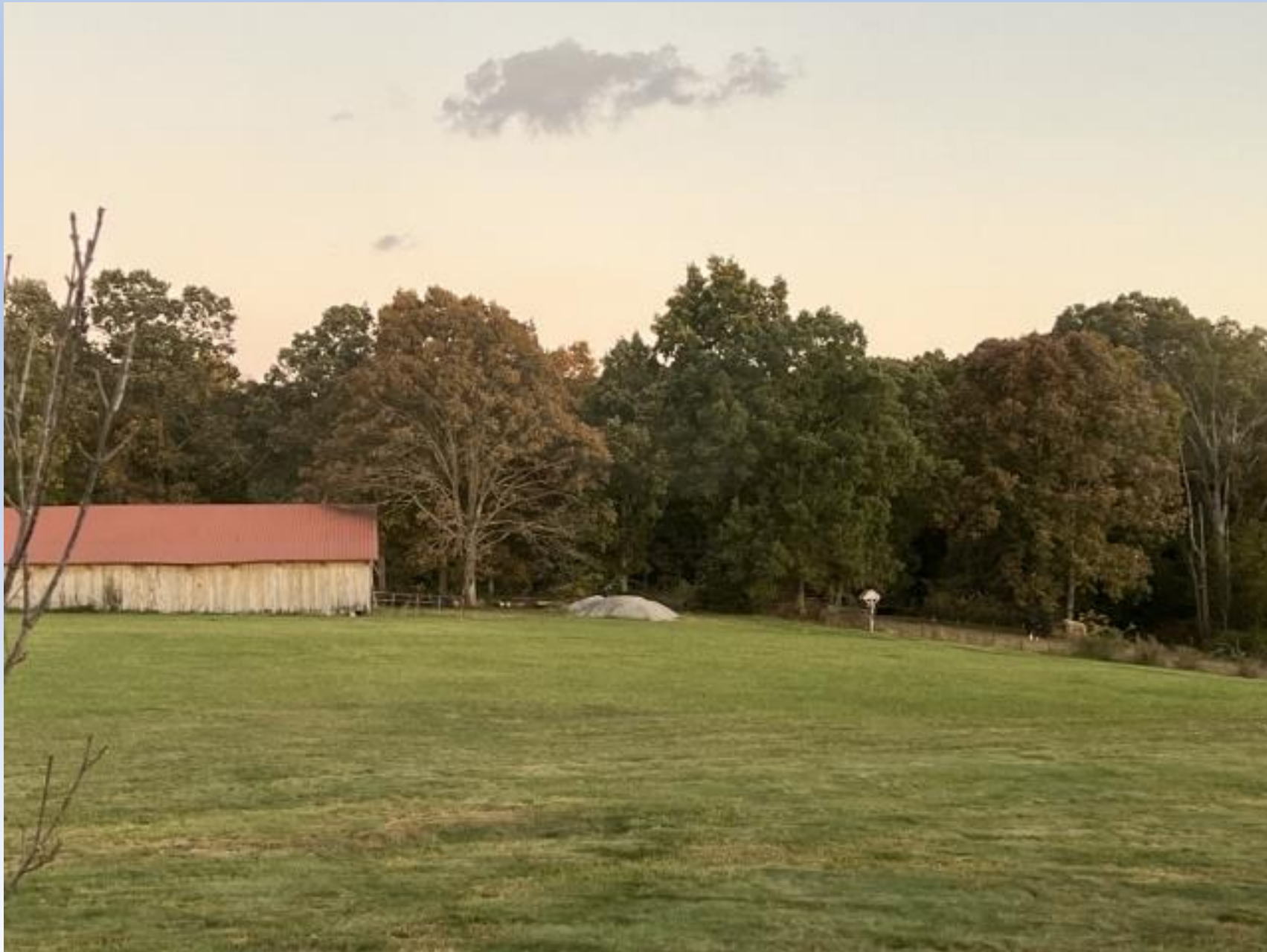
View from Master Bedroom