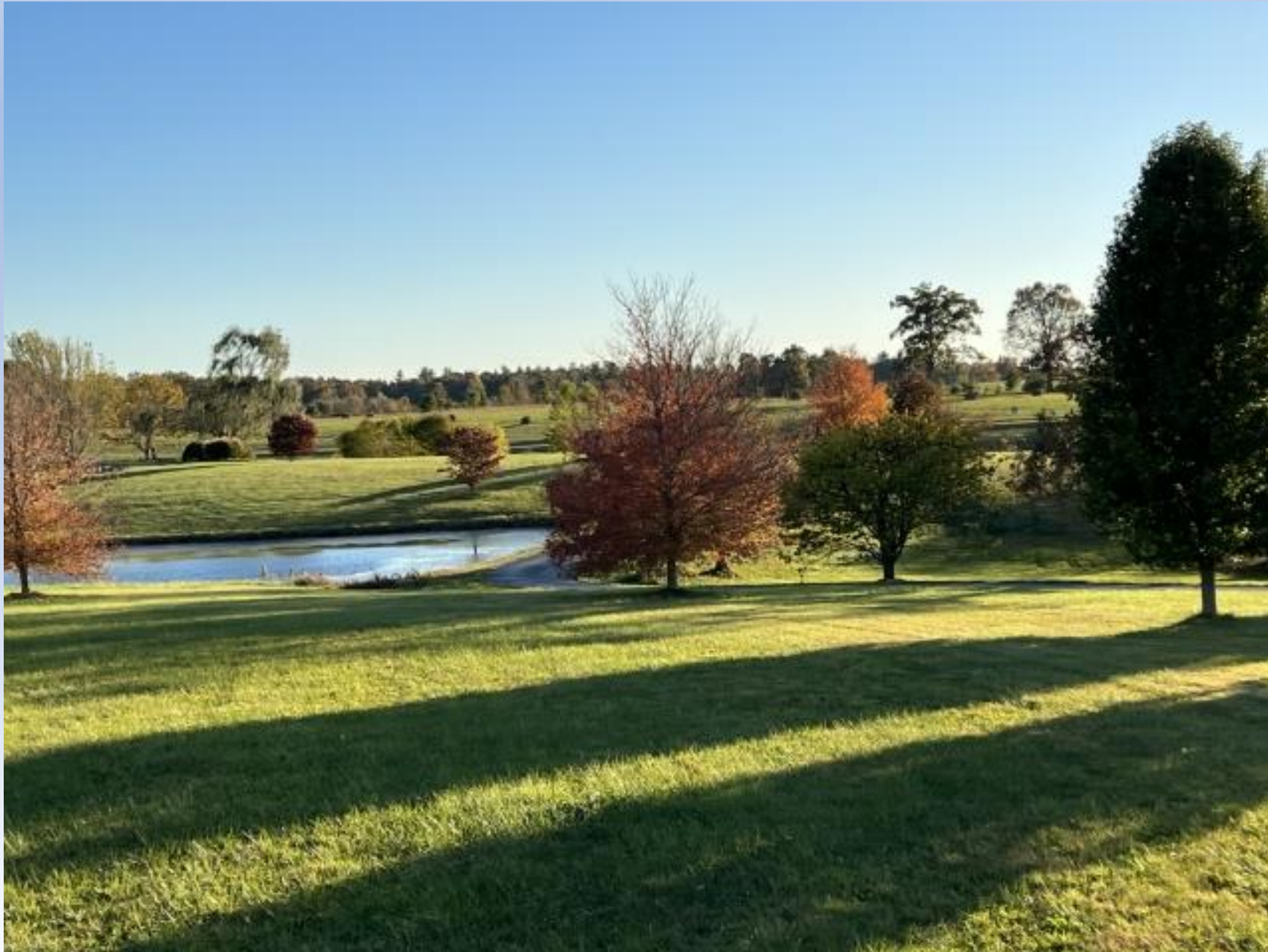
Approach view from driveway