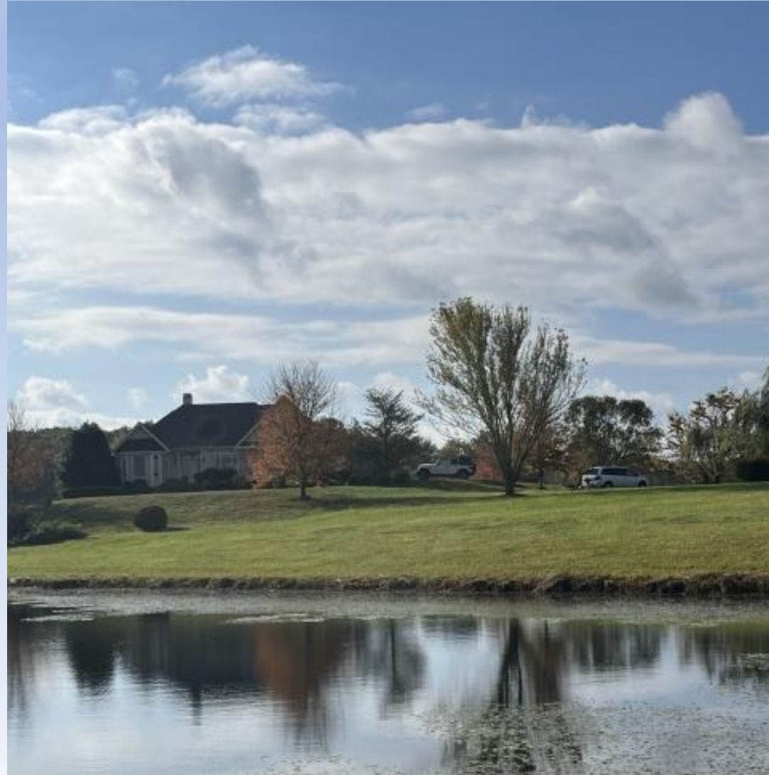
View from driveway