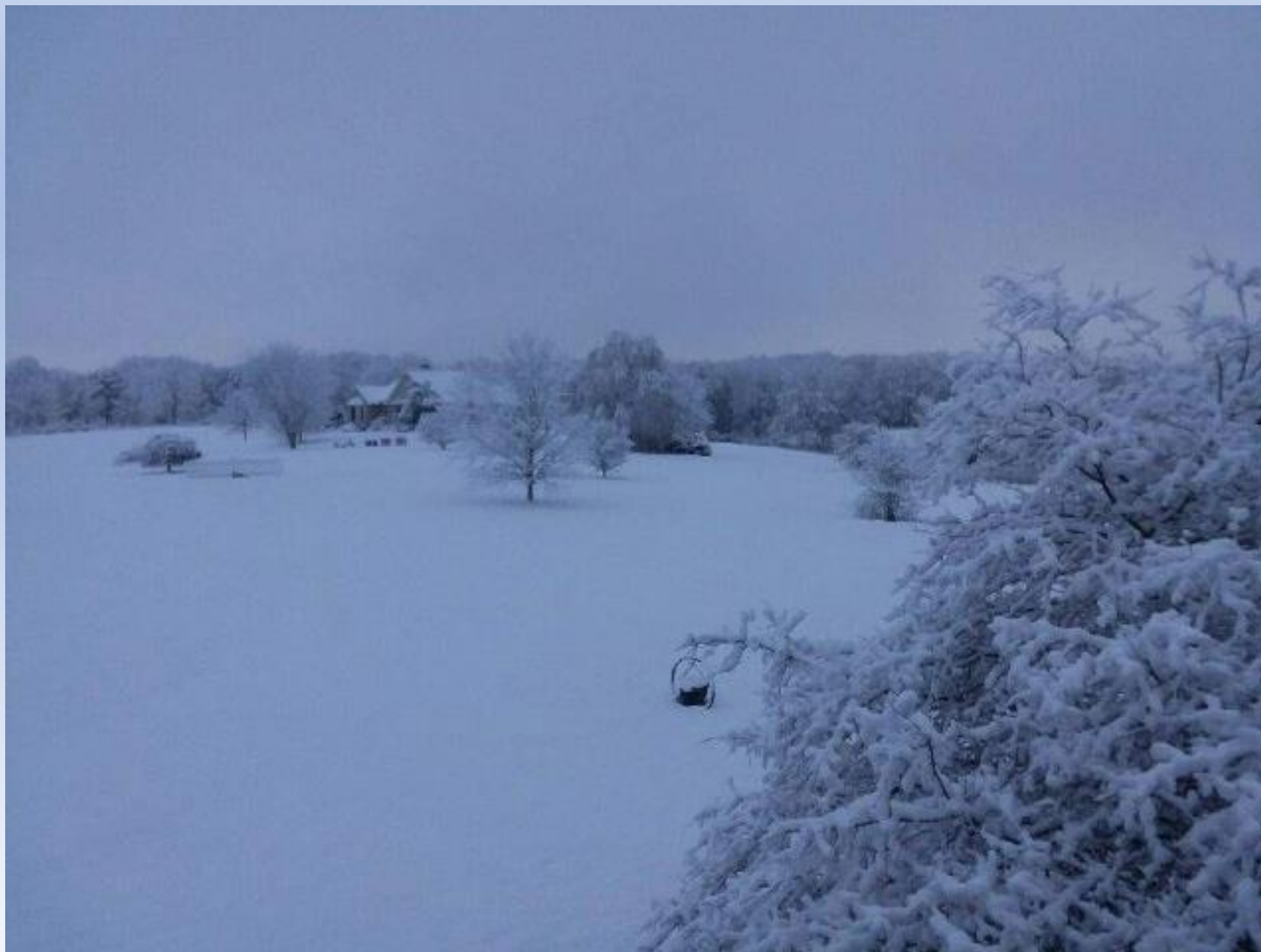
Main House winter view