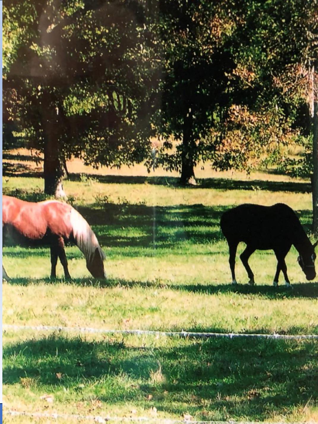
Horses in the pasture