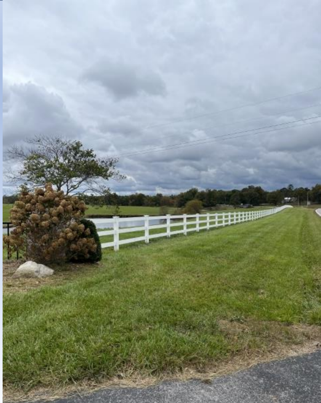
Looking west from entrance